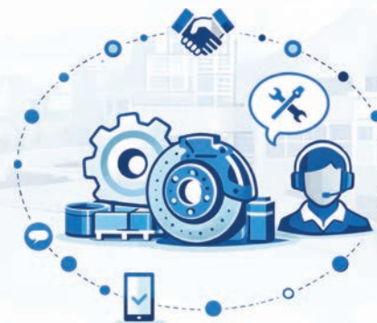
Spare Parts Business